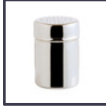
Code: E7142 Coffee Shaker UPO – x 1 Cost - £5.97