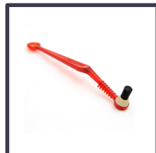
Code: EF458 Cleaning Brush UPO – x 1 Cost - £8.52