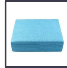
Code: PO7754 Blue Bar Towel (Lactose Free) UPO – 1 x 25 Cost - £5.95