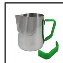
Code: DH677 Dairy Milk Handle UPO – x 1 Cost - £2.36