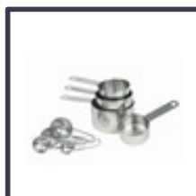
Code: E7073 Measuring Spoons UPO – x 1 Cost - £2.98