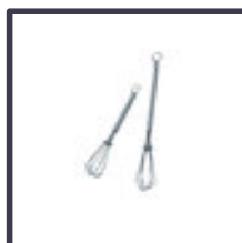
Code: D2636 Mini Whisk Set UPO – x 1 Cost - £0.85