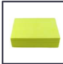
Code: PO7757 Yellow Bar Towel (Soya/Oat) UPO – 1 x 25 Cost - £5.95

NB. All costs are based upon MKT1 price file