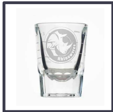
Code: DH683 2oz Lined Shot Glass UPO – x 1 Cost - £2.10