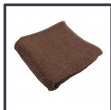
Code: DH668 Square Brown Bar Towel UPO – x 1 Cost - £1.74