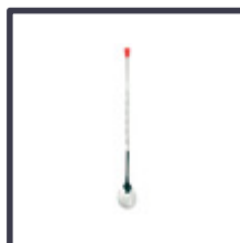
Code: D2162 Mixing Bar Spoon UPO – x 1 Cost - £3.68