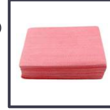
Code: PO7756 Red Bar Towel (Nut Based) UPO – 1 x 25 Cost - £5.95