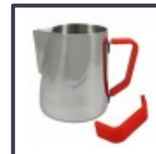
Code: DH678 Nut Based - Non Dairy Handle UPO – x 1 Cost - £2.36