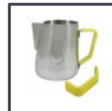
Code: DH679 Soya/Oat - Non Dairy Handle UPO – x 1 Cost - £2.36