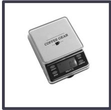
Code: DH682 Digital Dose Scale UPO – x 1 Cost - £8.97