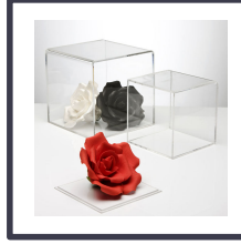
Code: D1304 Cube for Bar Towels (Luminati) UPO – x 1 Cost - £7.80