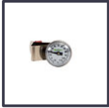
Code: E3737 Dial Milk Thermometer UPO – x 1 Cost - £3.58