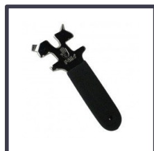
Code: DH680 Palo Caffine Wrench UPO – x 1 Cost - £11.45