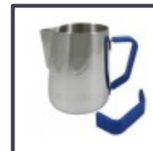
Code: DH676 Lactose Free Handle UPO – x 1 Cost - £2.36

NB. All costs are based upon MKT1 price file