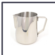
Code: DI335 20oz Pro Milk Pitcher UPO – x 1 Cost - £11.49