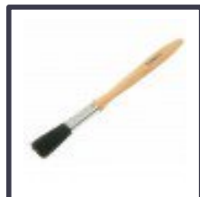
Code: DH669 1" Coffee Grinder Brush UPO – x 1 Cost - £6.39