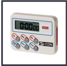
Code: DH670 Shot Timer UPO – x 1 Cost - £10.84